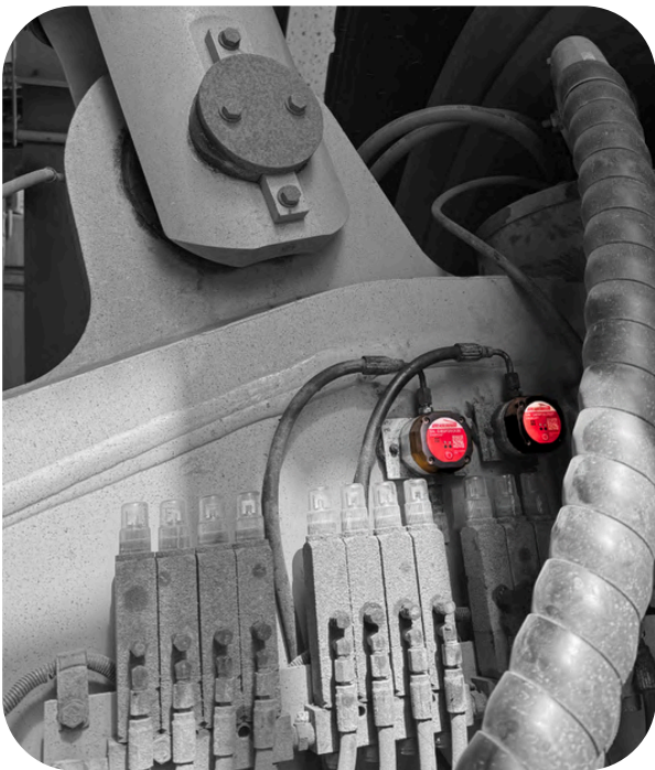
Endpoint LF monitoring kingpins – mounted on magnetic brackets

The maintenance team suspected it was related to grease, but couldn't pinpoint the exact issue. This uncertainty led to significant operational challenges and continued asset downtime , highlighting the need for precise monitoring and diagnostics to identify the root cause, prevent further failures and ensure optimal performance.